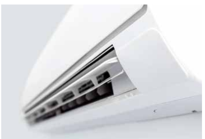
Single zone units are designed for cooling only or low heat applications.