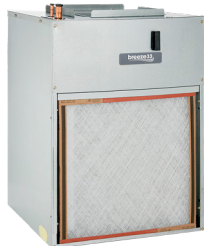
Wall Mount Air Handler (18K - 36K)