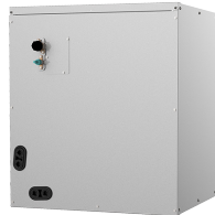
A-Coil (18K - 48K)

Breeze33 inverter 24V combined both 485 and 24V control are compatible with both Breeze33 system and third party indoor and outdoor units integrated into the traditional 24V system. Ratings are for Breeze33 outdoor and indoor J series match up.