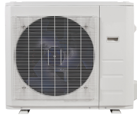
(12K - 60K)